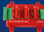
PRE-WIRED LOOP RACK