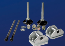
JAMB TRACK HARDWARE